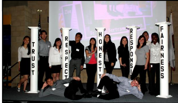
↑↓ Pics from 2011 & 2012 Face2Face Week and AI Ceremony ↓↑